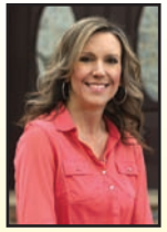
297 Kinderkamack Road Oradell, NJ 07649

CELL: 201-982-2200 • OFFICE: 201-599-1100 x348 • FAX: 201-599-1119