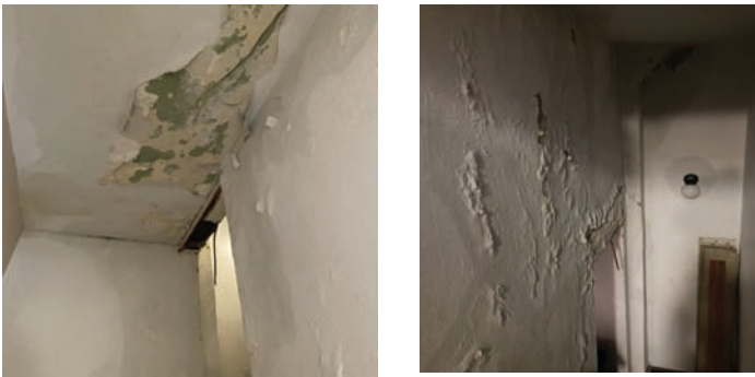
Interior damage in the east tower that we need to repair

We cannot neglect or postpone these repairs any longer. We will have to get a new HVAC system for OLPH Church sooner than later. We need a new and up-to-date air conditioning system and heating system. We only received a total of $5.00 for this project. This is going to be a very large expense for us. A better system will reduce our utility costs for the church.