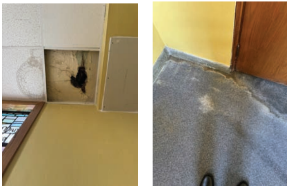
Interior damage in the west tower from the air conditioning unit dripping large amounts of water.