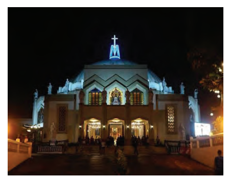
INTERNATIONAL SHRINE OF OUR LADY OF PEACE AND GOOD VOYAGE IN THE PHILIPPINES

Now, every time I have a chance to go back to the Philippines, I always try to visit two beautiful churches in Metro Manila area: the Shrine of Our Lady of Our Lady of Peace and Good Voyage and the Shrine of Our Mother of Perpetual Help .