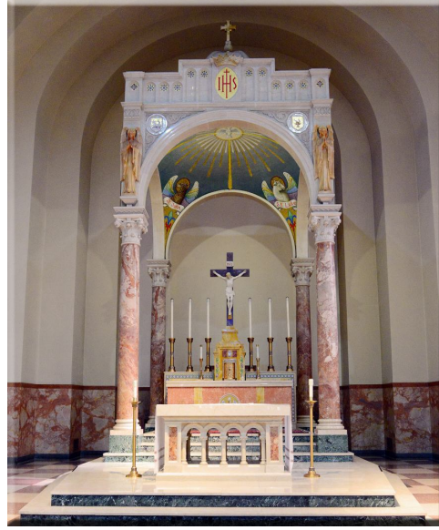
Saint Anthony Church 626 South Olden Avenue