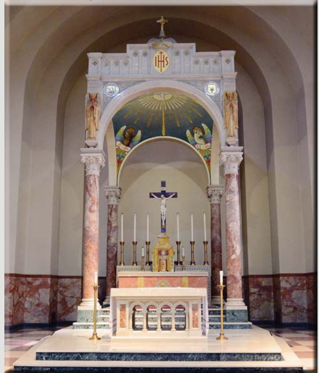
Saint Anthony Church