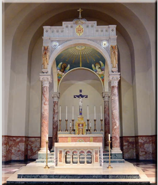
Saint Anthony Church