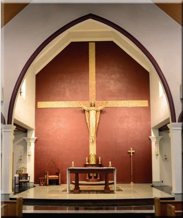
Our Lady of Sorrows Church