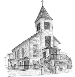
OUR LADY OF THE ROSARY OF FATIMA CHURCH 188 Wayne Street

OLRF: Sunday, 9:00 - 9:20 AM (Portuguese)