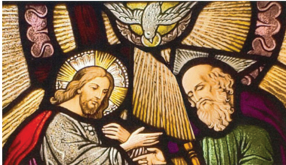
Detail of Trinity, Coronation stained glass, Parish Center Chapel