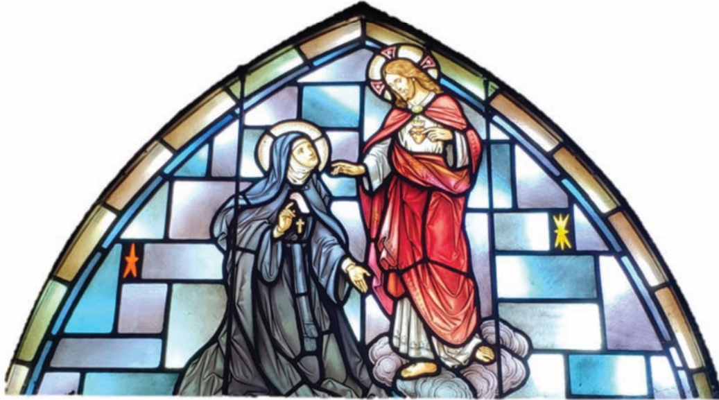
Window over church front door: St. Margaret Mary Alacoque and Jesus