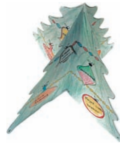
Different angles of completed tree.