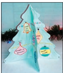
Weeks 1 & 2 together.