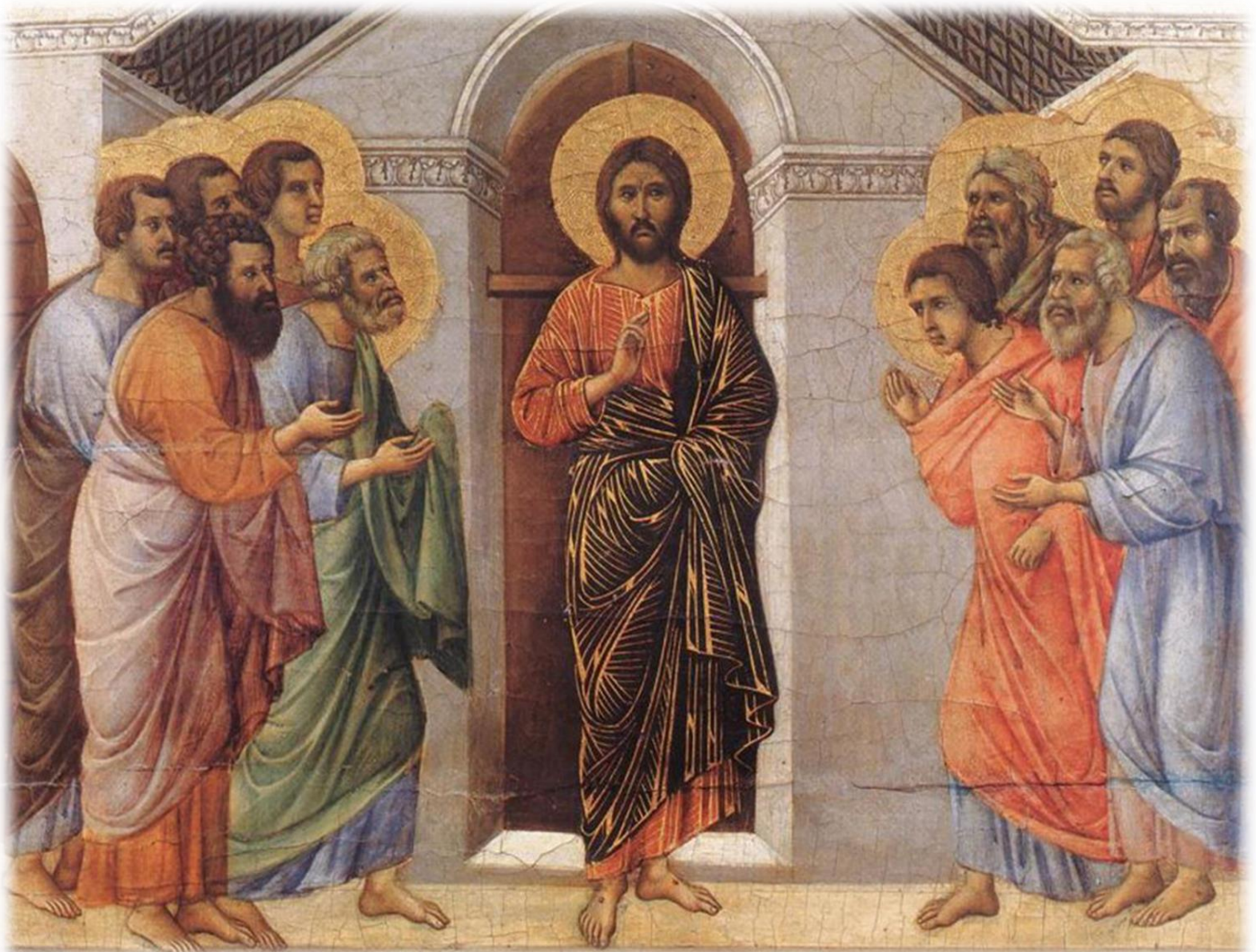
Christ Appears to the Apostles Behind Closed Doors, Duccio di Buoninsegna, ca. 1308-11

406 Forman Avenue Point Pleasant Beach, NJ 08742 (732) 892-0049 www.stpetersbytheshore.org