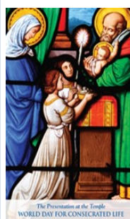
The Presentation of the Temple WORLD DAY FOR CONSECRATED LIFE

DO YOU PAY YOUR EXPENSES ONLINE? FAITH DIRECT allows you to support our parish using a credit/debit card or electronic fund transfer from a bank account just as you may do now with your other expenses. If you are interested, enroll online at www.faithdirect.net . Thank you for your support!