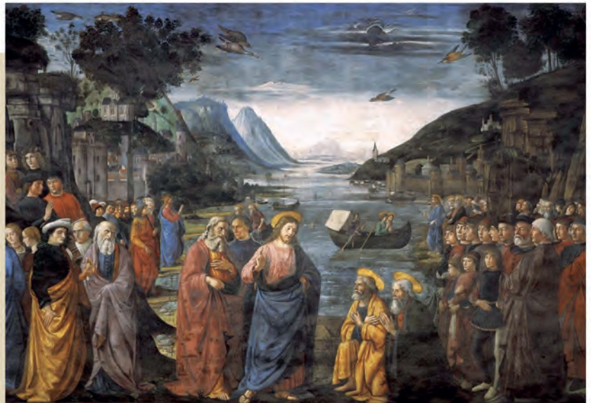
"Vocation of the Apostles" | | Artist: Domenico Ghirlandaio (c. 1481-1482)

Sunday | 9:00 am - 12:30 pm Mon, Wed, Thu | 9:00 am - 12:00 pm Office Hours by Appointment