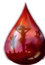
The Precious Blood of Jesus