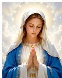
The Blessed Virgin Mary