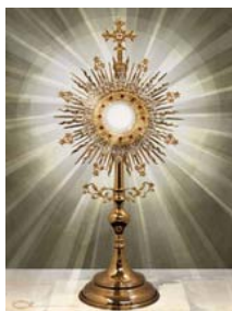
The Blessed Sacrament