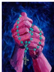
The Holy Rosary