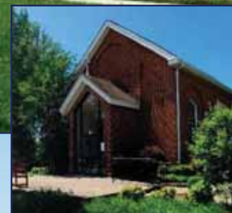
Historic Church – circa 1866