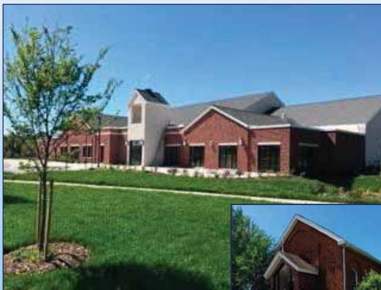
Main Campus – open June 2017

Eucharistic Adoration: Wednesday from 7-9:00pm; First Fridays from 9:30am-6:30pm