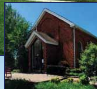
Historic Church – circa 1866