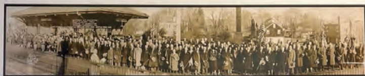
Knights of Columbus Council 10000 March 19, 2024