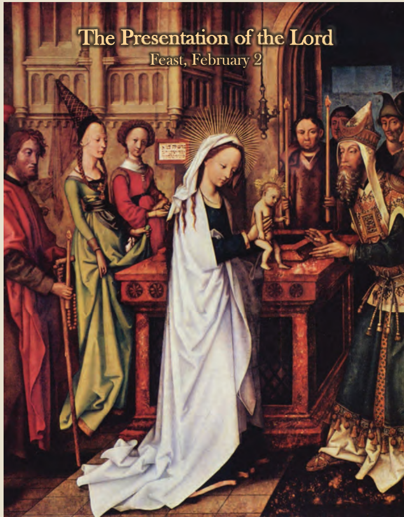
The Presentation of the Lord Feast, February 2

1879 Applewood Drive, Orefield, PA 18069-9507 • (610)-395-2876 • www.stjw.org