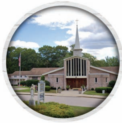
Our Lady of the Lakes Church