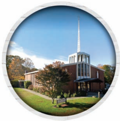
Saint John the Evangelist Church