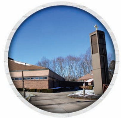
Our Lady of Perpetual Help Church