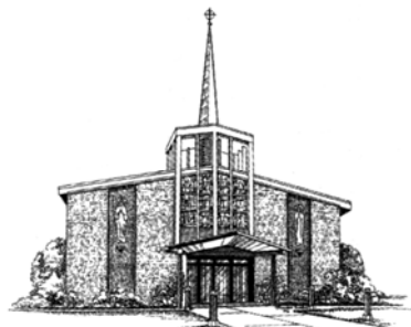
Saint John the Evangelist Church