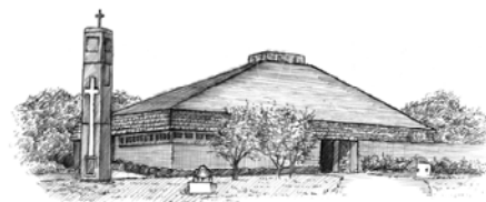
Our Lady of Perpetual Help Church