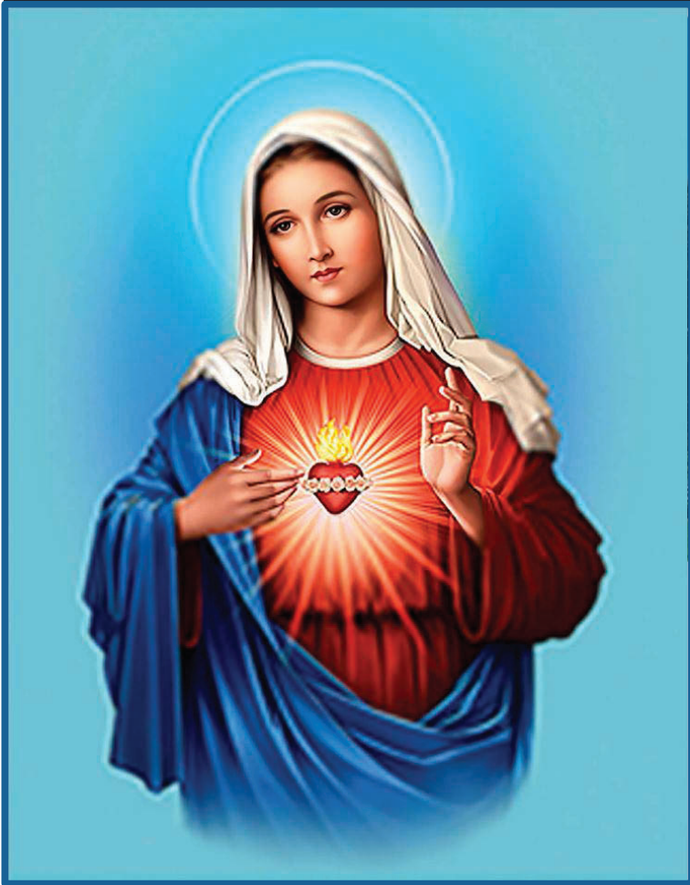
Solemnity of The Immaculate Heart of the Blessed Virgin Mary June 13 th , 2026

ELEVENTH SUNDAY IN ORDINARY TIME - DECIMOPRIMER DOMINGO DEL TIEMPO ORDINARIO- JUNE 14 TH , 2026