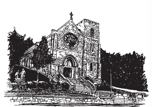
ST. THERESA Briarcliff Manor, NY