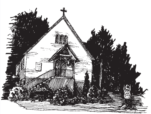
OUR LADY OF THE WAYSIDE Millwood, NY