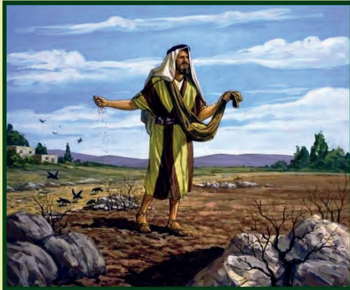
The Parable of the Sower Mt 13:1-23

Parish Office / Religious Ed. 201-444-0272 Office hours: Mon-Fri 9am-2pm (Office closed 12-12:30 for lunch)